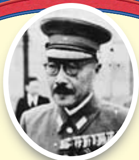
HIDEKI TOJO 1884–1948

U.S. newspapers described Hideki Tojo as "smart, hard-boiled, resourceful, [and] contemptuous of theories, sentiments, and negotiations."